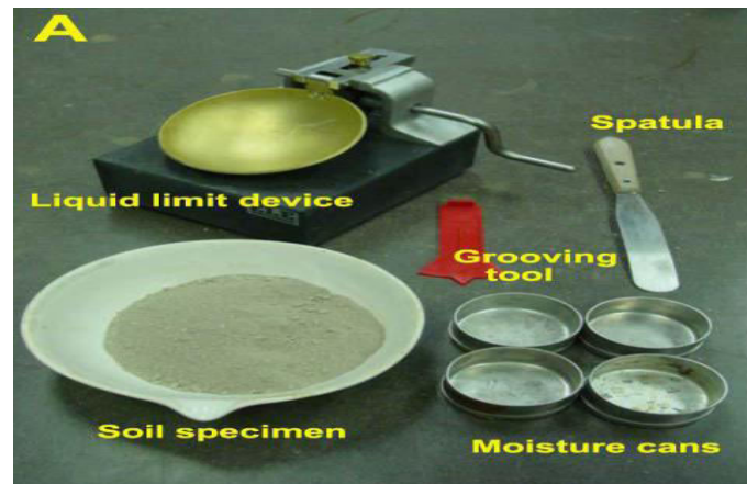
Fig.3.3 – Casagrande's Apparatus