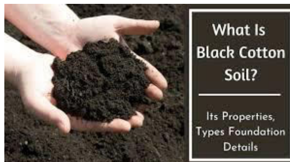
Fig. 1: - black cotton soil

Also called as Black Cotton soils or Regur soils, expansive soils in the Indian subcontinent are mainly found over the Deccan trap (Deccan lava tract), which includes Maharashtra, Andhra Pradesh, Gujarat, Madhya Pradesh, and some scattered places in Odisha. These soils are also found in the river valley of Narmada, Tapi, Godavari and Krishna. The depth of black cotton soil is very large in the upper parts of Godavari and Krishna, and the north-western part of Deccan Plateau. Basically, after the chemical decomposition of rocks such as basalt by various decomposing agents, these are the residual soils left behind at the place of such an event. Cooling of volcanic eruption (lava) and weathering another kind of rock igneous rocks are also processes of formation of these types of soils. Rich in lime, alumina, magnesia, and iron, these soils lack in nitrogen, phosphorus and organic content.