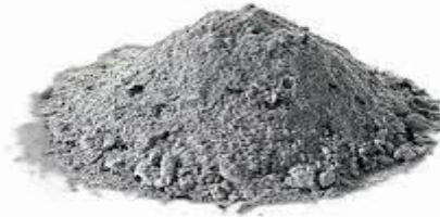
FLY ASH HSN Code - 26219000