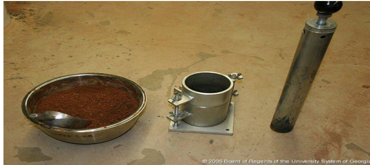
4Fig. 3.3 Standard proctor test

Obtain a sufficient quantity (10kg) of air-dried soil and pulverize it. Take about 5 kg of soil passing through 19mm sieve in a mixing tray.